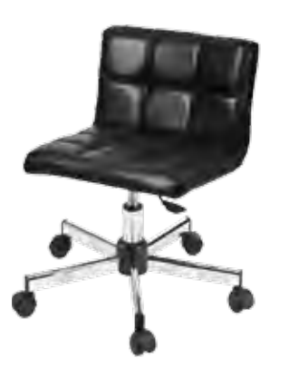
580BL Waffle Pedi Chair Black Color Only Adjustable Height: 15"-18"