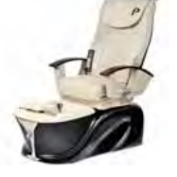
PS60-2 BEIGE CHAIR TOP