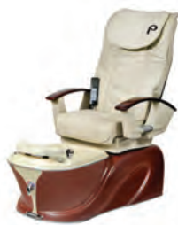
PS61-2 BEIGE CHAIR TOP