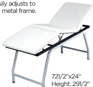
72 1/2"x24" Height: 29 1/2"

The Relax is a facial, massage & waxing bed that easily adjusts to any position. Sturdy metal frame.