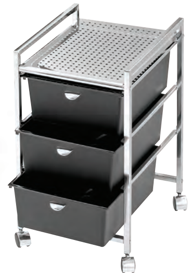
D23 Pedi Cart

Available in all Pibbs' Vinyl Colors Adjustable Height: 15"-18"