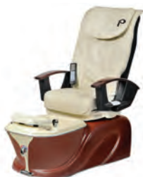
PS61-4 BEIGE W/ BLACK ACCENT CHAIR TOP