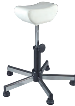
736 Valet Leg Rest

This portable pedicure leg rest is perfect for pedicures when space is tight. Adjustable height.