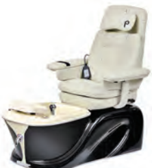
PS60-7 BEIGE VIBRATION ONLY CHAIR TOP