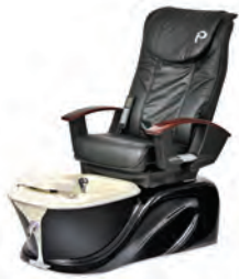
PS60-1 BLACK CHAIR TOP