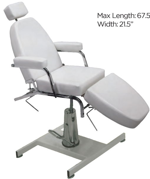
HF809 Facial Chair with Hydraulic Base