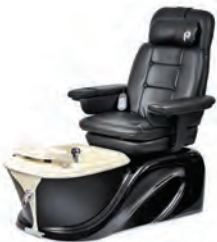
PS60-6 BLACK VIBRATION ONLY CHAIR TOP