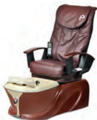
PS61-5 BURGUNDY WITH BLACK ACCENT CHAIR TOP