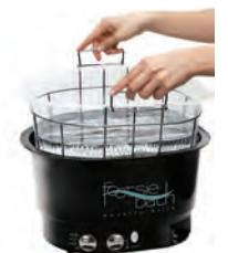
FM3847 Metal Tray