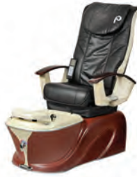
PS61-3 BLACK W/ BEIGE ACCENT CHAIR TOP