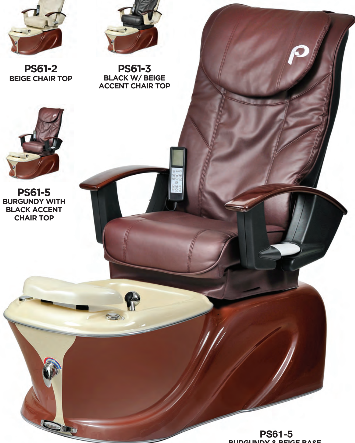
PS61-5 BURGUNDY & BEIGE BASE BURGUNDY W/ BLACK ACCENT CHAIR TOP 52L X 29W X 63H