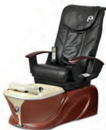
PS61-1 BLACK CHAIR TOP