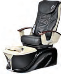
PS60-3 BLACK W/ BEIGE ACCENT CHAIR TOP