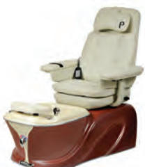
PS61-7 BEIGE VIBRATION ONLY CHAIR TOP