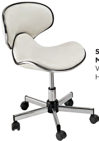
545 Butterfly Mini Pedi Chair Width: 16" Height: 15-18"

Swivel Chair top with Reclining Back, & Full Massage System with 6 vibration & heat. (Black / Granito Base)