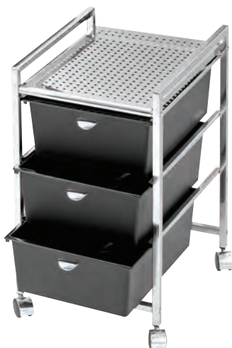
D23 Pedi-Cart L: 15.6" W: 13.2" H: 22.9"