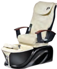
PS60-4 BEIGE W/ BLACK ACCENT CHAIR TOP