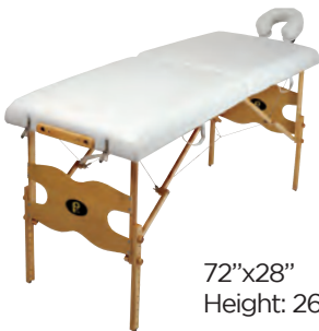
72"x28" Height: 26 1/2"-36 1/2"

Adjustable Height, Fully Portable, Folds conveniently Carrying case included for easy transport.