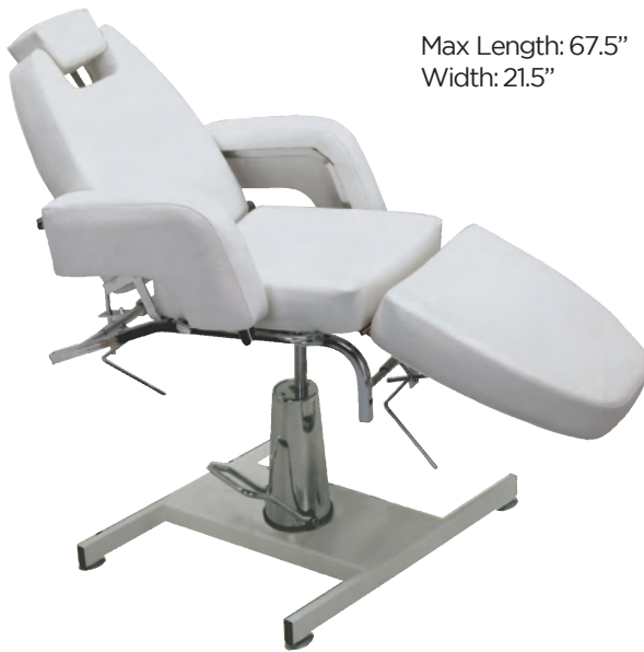
HF803 Deluxe Facial Chair with Hydraulic Base

The HF801, HF803, HF809 & SF807 beds are the most versatile & elegant beds available today. They feature adjustable back, leg & headrest that will adjust from completely flat to upright. All the beds allow you to adjust the height with a heavy duty hydraulic pump on a 24" X 30" H - base for added stability. Double polish chrome finish frame for lasting beauty. These chairs are shown in white, but can be made in any PIBBS Vinyl Color.