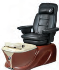
PS61-6 BLACK VIBRATION ONLY CHAIR TOP