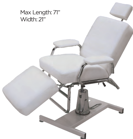
HF801 Facial Chair with Hy