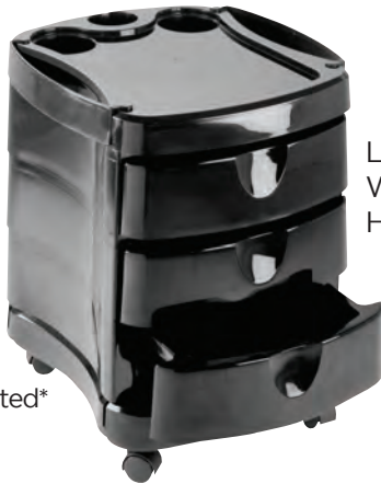
2045 Modular System