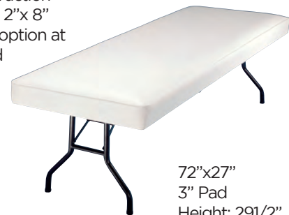
72"x27" 3" Pad Height: 29 1/2"

Massaging table features folding legs for easy storage. Sturdy construction & extremely stable. Features a 2"x 8" facial cutout is available as an option at an additional charge. Standard white, but available in any Pibbs' Vinyl color.