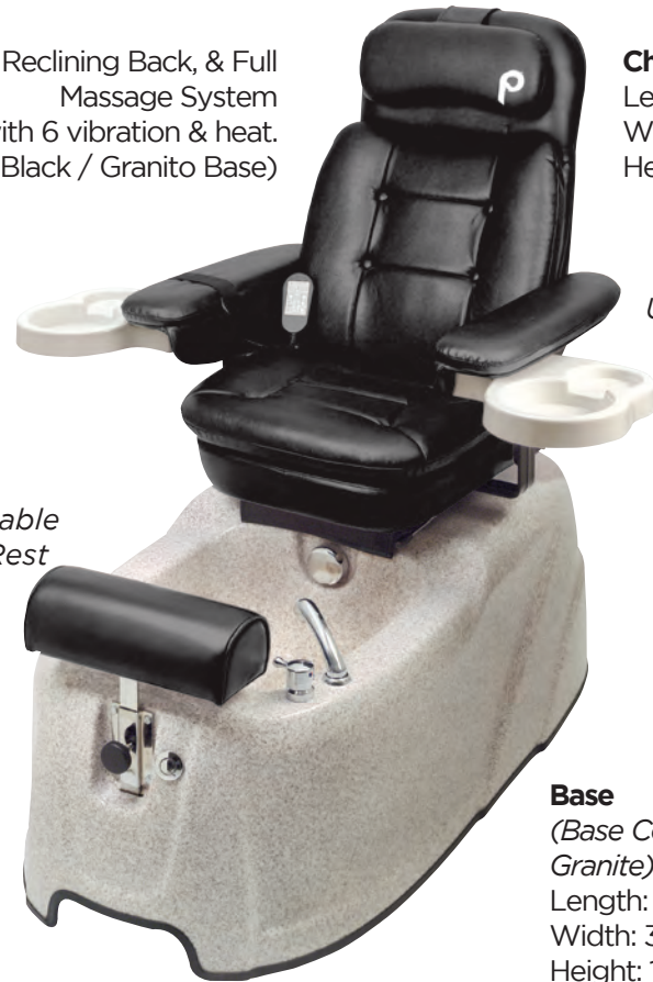
Chair Top Length: 24" Width: 33" Height: 35"