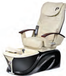
PS60-2 BEIGE CHAIR TOP