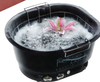
FM3848 Footsie Bath Complete