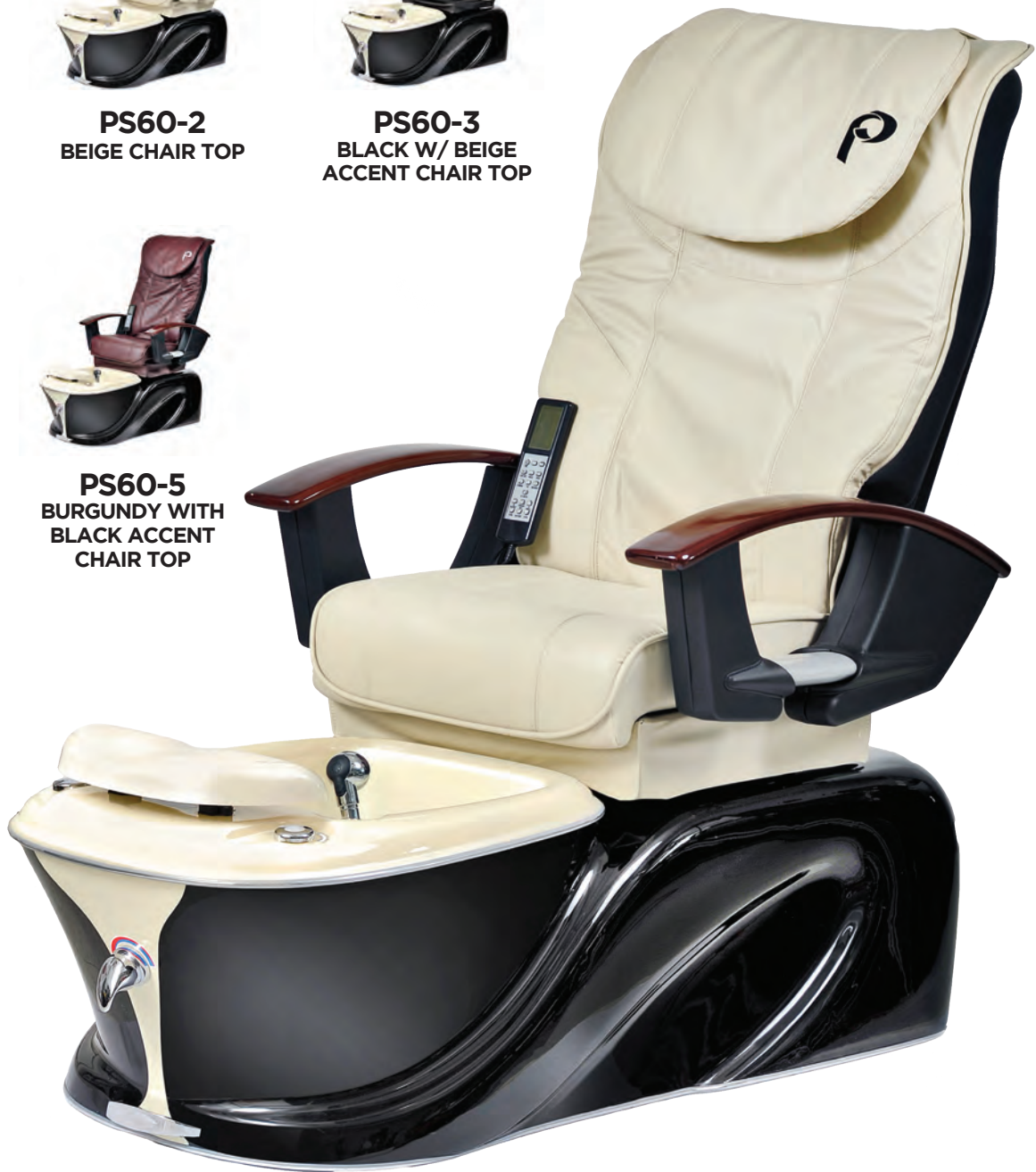
PS60-4 BLACK & BEIGE BASE BEIGE W/ BLACK ACCENT CHAIR TOP 52L X 29W X 63H