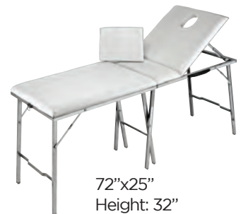
72"x25" Height: 32"

The FB705A Valigia bed is portable & easy to carry no matter where you go. It also features an adjustable back. With Face Cut-out & Pillow.