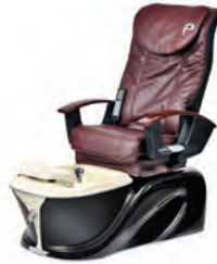
PS60-5 BURGUNDY WITH BLACK ACCENT CHAIR TOP