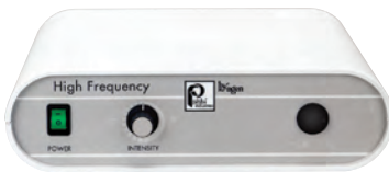
2530 High Frequency